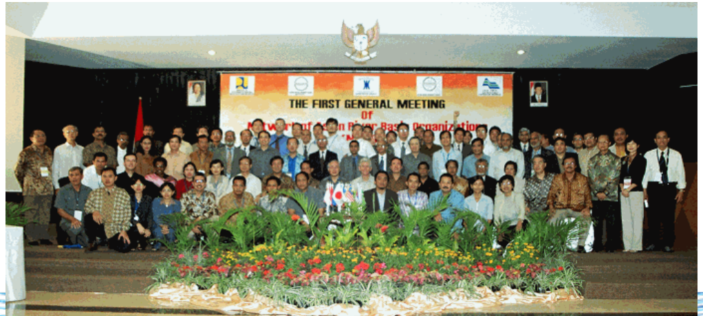
1 st NARBO General Meeting in 2004