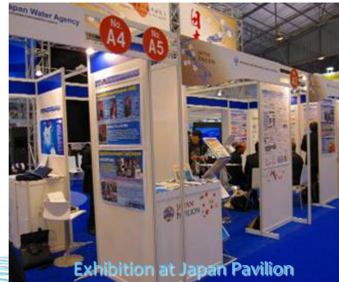
Exhibition at Japan Pavilion