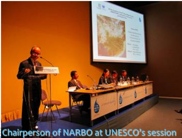
Chairperson of NARBO at UNESCO's session