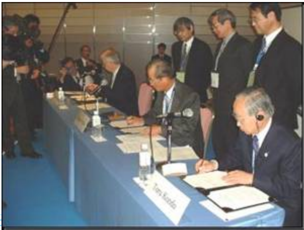
Letter of Intent for NARBO